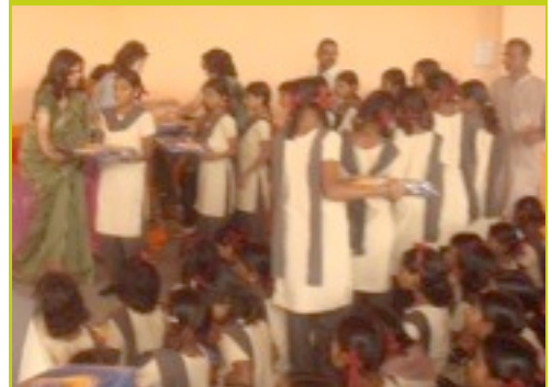
Excited girls queuing up to receive their school backpacks