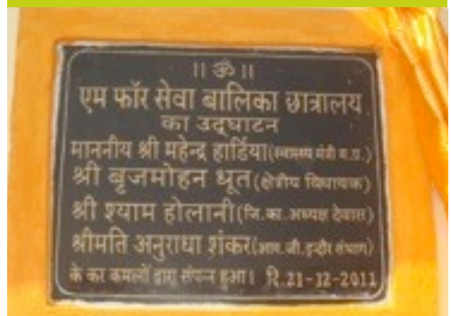
The Student Home Building